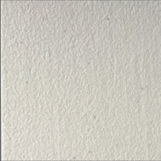
SP BASE MICROCEMENTO