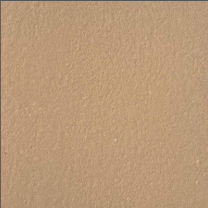
SP FINISH MICROCEMENTO 4