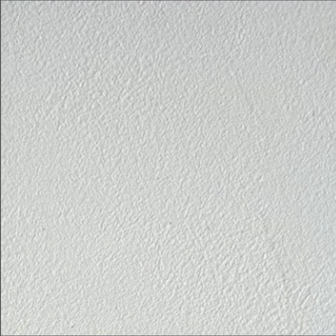
SP FINISH MICROCEMENTO