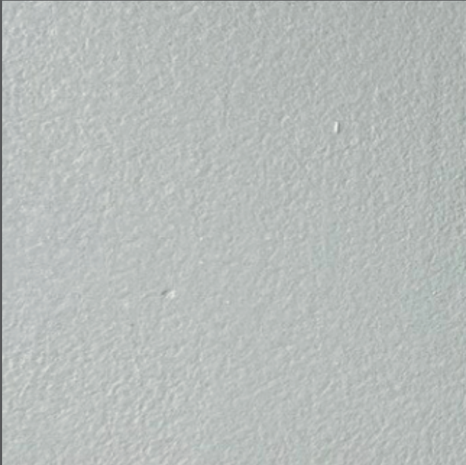
SP FINISH MICROCEMENTO 1