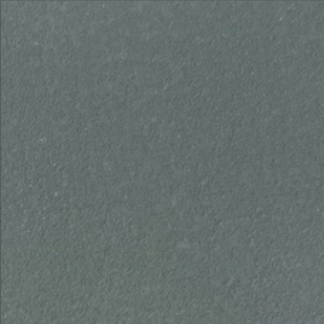
SP FINISH MICROCEMENTO 2